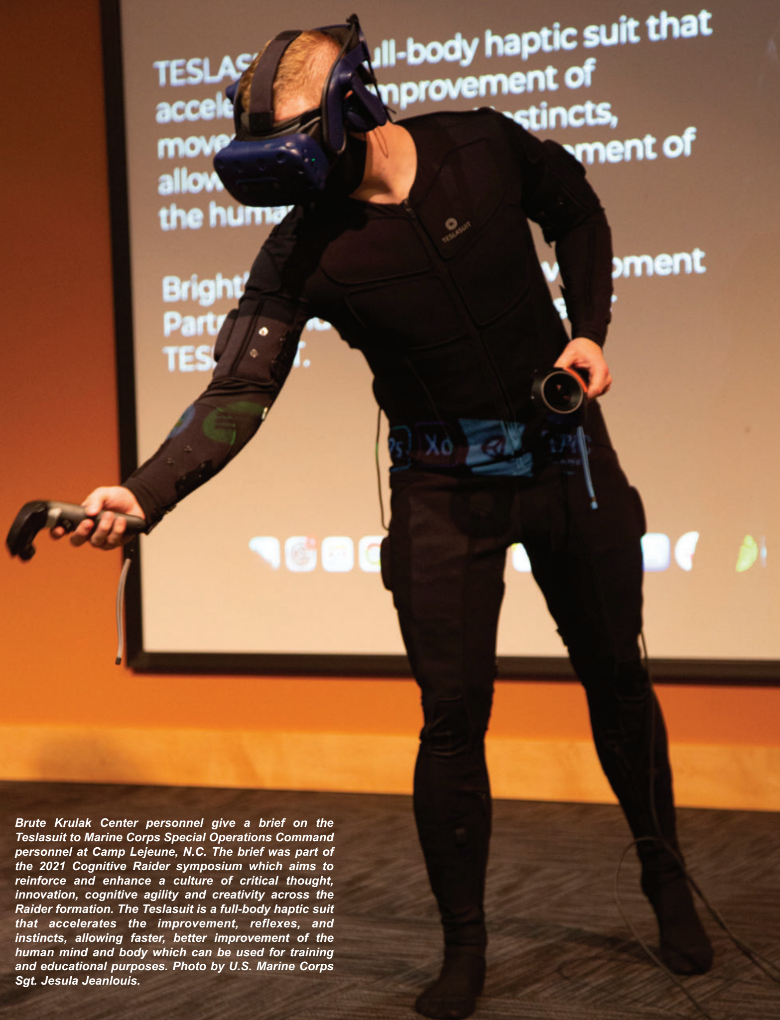
Brute Krulak Center personnel give a brief on the Teslasuit to Marine Corps Special Operations Command personnel at Camp Lejeune, N.C. The brief was part of the 2021 Cognitive Raider symposium which aims to reinforce and enhance a culture of critical thought, innovation, cognitive agility and creativity across the Raider formation. The Teslasuit is a full-body haptic suit that accelerates the improvement, reflexes, and instincts, allowing faster, better improvement of the human mind and body which can be used for training and educational purposes.