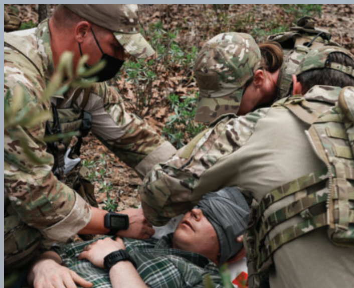
Combat Aviation Advisors assigned to the 711th Special Operations Squadron provide medical care to a simulated casualty during a proficiency exercise near Eglin Air Force Base, Fla., March 17, 2021. The team avoided simulated protests and social unrest that blocked roadways to access the casualty and provided care.

This new method of accomplishing training to maintain readiness is slated to occur at least once a year going forward and will prepare Citizen Air Commandos to carry out the aviation foreign internal defense mission downrange.