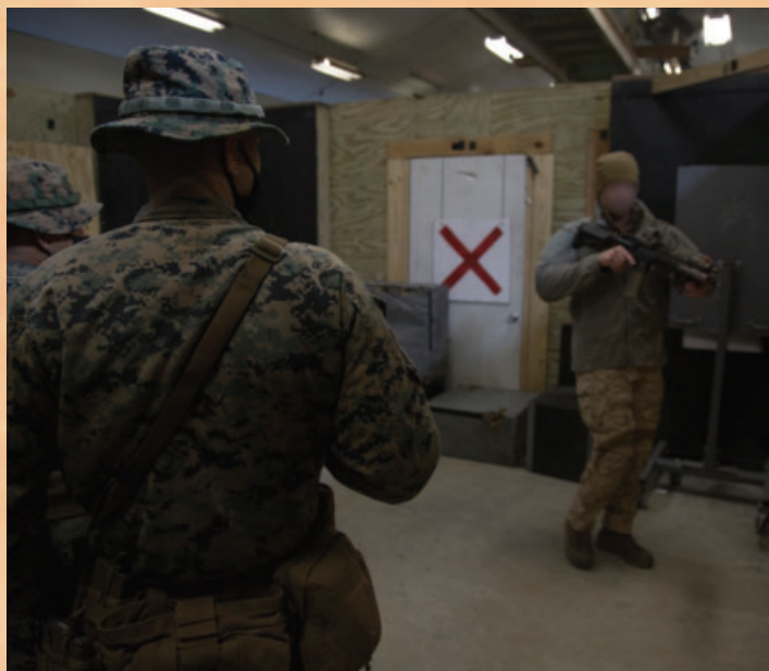
Marine Raiders with 3rd Marine Raider Battalion train Marines with 1st Battalion, 8th Marines on close quarters battles tactics at Camp Lejeune, N.C., Jan. 28, 2021.

Collaboration between Raiders and the Fleet Marine Force is crucial in the event that a conventional Marine Corps unit is requested to support a SOF unit on the battlefield. For this reason, training that supports interdependence, interoperability, and integration becomes vital to the success of our nation’s future conflicts.