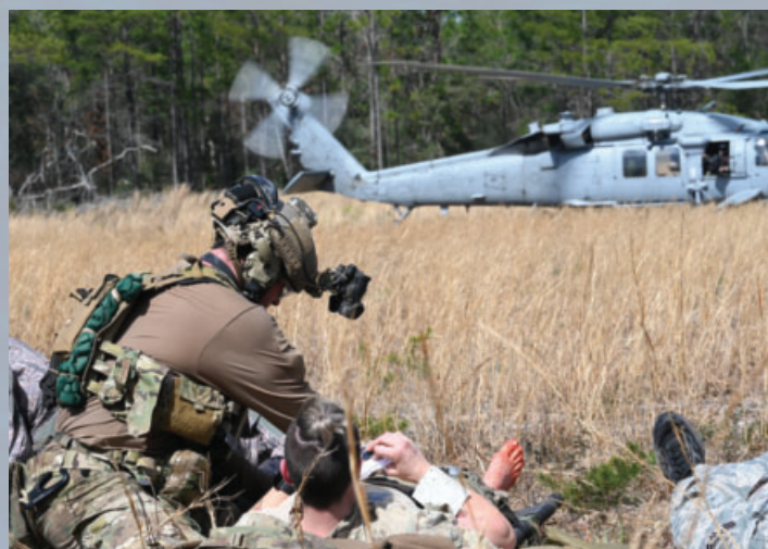
A U.S. Air Force Special Tactics operator assigned to the 24th Special Operations Wing provides medical care to a simulated casualty as a U.S. Navy MH-60 Sea Hawk from Helicopter Sea Combat Squadron Nine prepares to move casualties to a follow on medical treatment center during a personnel recovery training mission for Emerald Warrior 21.1, Feb. 25, 2021, at the Eglin Range Complex, Fla.