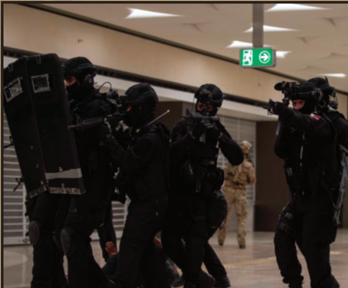
U.S. and Qatari military partner in crisis action exercise ... 6