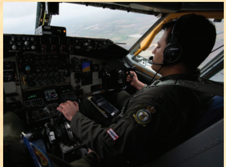
A U.S. KC-135 Stratotanker and aircrew from the 100th Air Refueling Wing support the Special Operations Forces from the 352nd Special Operations Wing and 41st Field Artillery Brigade execute another successful High Mobility Artillery Rocket System (HIMARS), Rapid Aerial Insertion (HIRAIN), coordinated with NATO allies, near Constanta, Romania, Apr. 10, 2021.

The successful completion of this HIRAIN operation finishes with a safe off-load of the HIMARS back in Germany, and a return to home-station of the SOF aircrew and aircraft to RAF Mildenhall, with plans to execute further iterations solidifying this enhanced deterrent option to ensure peace within the European theater.