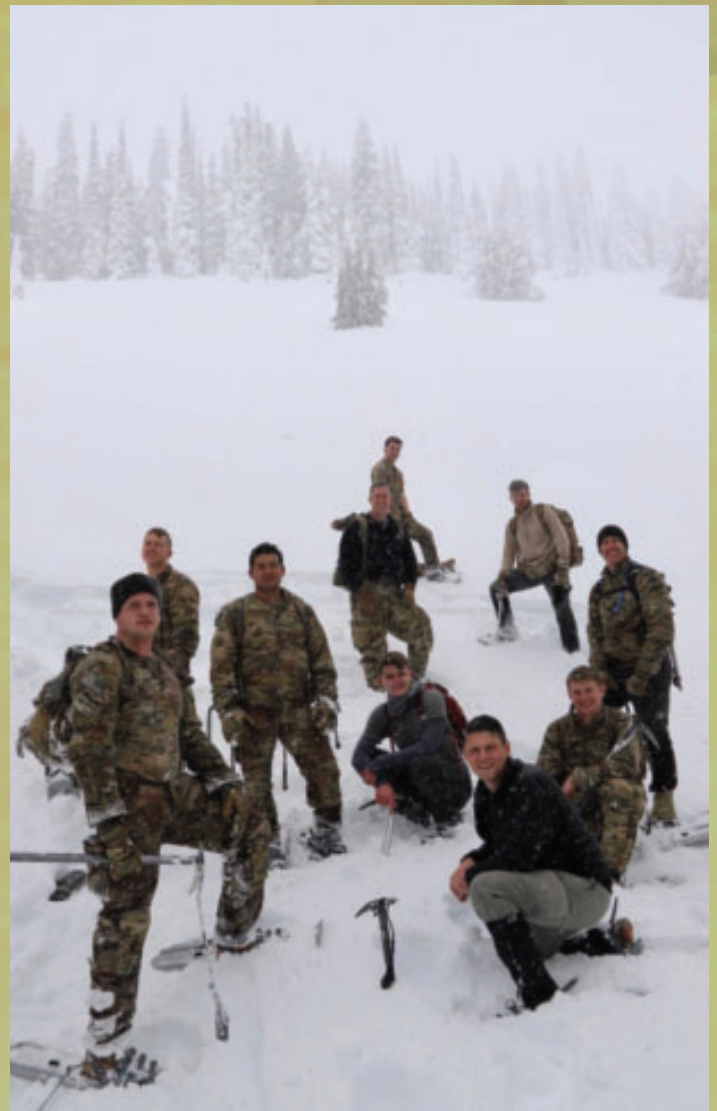
Ranger unit ministry teams from the 75th Ranger Regiment recently conducted mountaineering training at Eagle Peak in Mt. Rainier National Park, Wash.