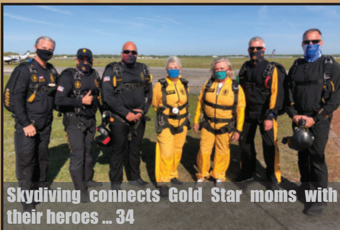
Skydiving connects Gold Star moms with their heroes ... 34