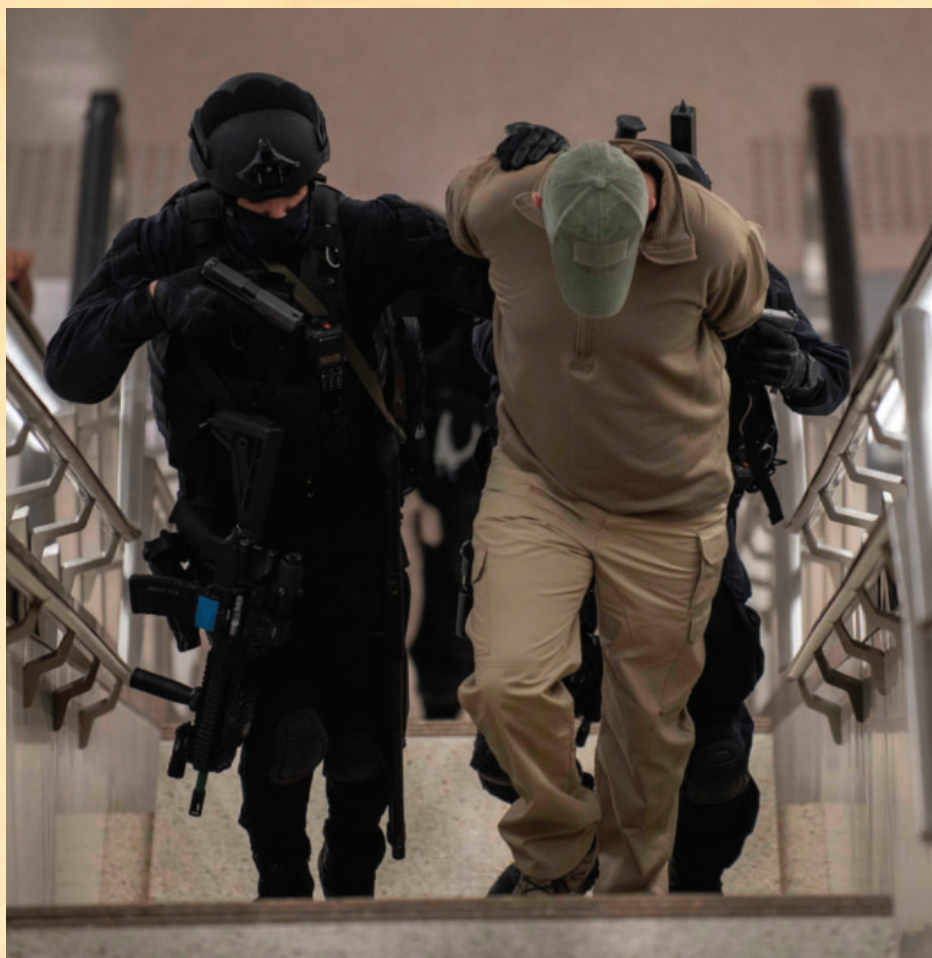
Qatari Special Forces escort a restrained gunman role-player, March 24, 2021, during U.S. Central Command’s crisis response exercise Invincible Sentry in Doha, Qatar. The annual bilateral exercise represents a unique opportunity to train with Qatari partners to practice critical crisis response capabilities.

These types of exercises are designed to strengthen military-to-military relationships and promote regional security. IS 21 is no different, producing bonds that are developed by training together toward a common goal—maintaining prepared ready and responsive forces to defend nations and protect their citizens.