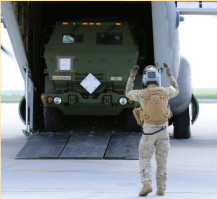
Special Operations Forces from the 352nd Special Operations Wing and 41st Field Artillery Brigade executed another successful High Mobility Artillery Rocket System (HIMARS), Rapid Aerial Insertion (HIRAIN), coordinated with NATO allies, near Constanta, Romania, Apr. 10, 2021.

insertion (HIRAIN) mission-set and other joint training opportunities in Romania.