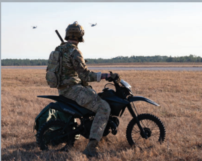
A U.S. Air Force Special Tactics operator, assigned to the 24th Special Operations Wing, watches U.S. Navy MH-60 Sea Hawk helicopters, assigned to Helicopter Sea Combat Squadron (HSC) 9, prepare to land on an airfield during Emerald Warrior 21.1, at the Eglin Range Complex, Fla., Feb. 23, 2021.