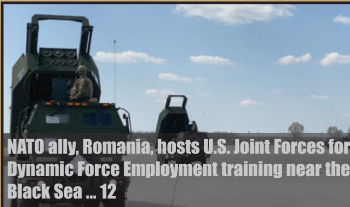
NATO ally, Romania, hosts U.S. Joint Forces for Dynamic Force Employment training near the Black Sea ... 12