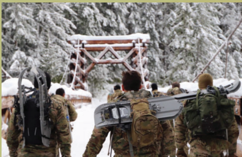
Ranger unit ministry teams with the 75th Ranger Regiment recently conducted environmental training and team building in Mount Rainer National Park, Wash.

The three-day training focused on pastoral skills, community revitalization, understanding generational shifts, operational religious support planning, crisis