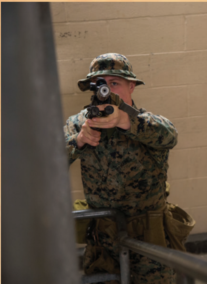
Marine Raiders with 3rd Marine Raider Battalion train Marines with 1st Battalion, 8th Marines on close quarters battles tactics at Camp Lejeune, N.C., Jan. 28, 2021.